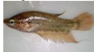
Figure 4. Betta imbellis

Betta akarensis , identification results obtained characteristics and classification of action fish in the swamp waters of Sawah Village such as yellow eyes are large; the fingers of the caudal fin are only branched in fish that exceed 4 cm in length. The body color is yellow-brown. Two color lines on the head are not very clear; one line starts from the snout to the back through the eyes (Figure 2).