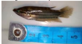
Figure 3. Betta waseri