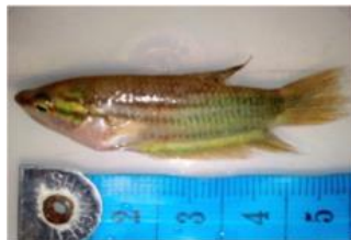
Figure 1. Trichopsis vittata

Trichopsis vittata , identification results obtained the characteristics and classification of action fish in the swamp waters of Sawah Village such as sharp and scaly head, terminal mouth position, the head has a yellow-brown color with two lines behind the eyes. The upper part of the body is blackish brown; the sides of the body are brown and greenish and have two dark color lines extending from the eyes to the middle of the body. The identification results follow the identification book guide by Kottelat et al. (1993) (Figure 1).